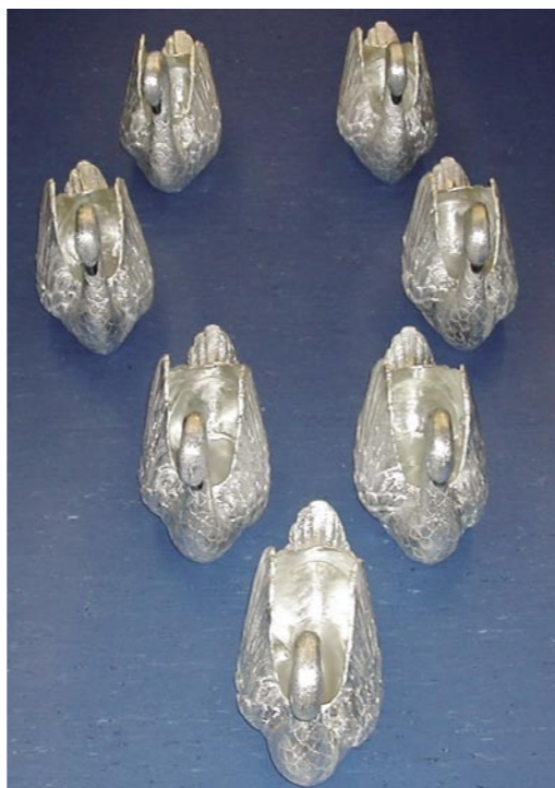
ASSAY OFFICE LONDON