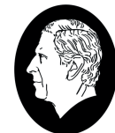
Coronation Mark (optional)